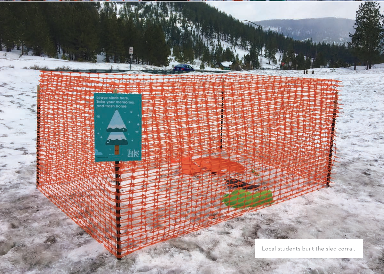
Local students built the sled corral.