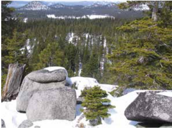
Rim Trail, designated by National Geographic Adventure magazine in 2006 as one of the nation's top ten trails.

OPENED IN THE SUMMER OF 2011 , Van Sickle Bi-State Park is one of the few bi-state parks in the United States that provides access to both sides of a state line. The park's unique location, close to the concentration of tourist and residential accommodations near Heavenly Village and the Stateline Casino Core, provides the opportunity for people to access Tahoe's outdoor environment on foot from their lodging. The Daggett Summit Spur trail, also completed in 2011, provides an integral connection from Van Sickle Bi-State Park to the famed Tahoe