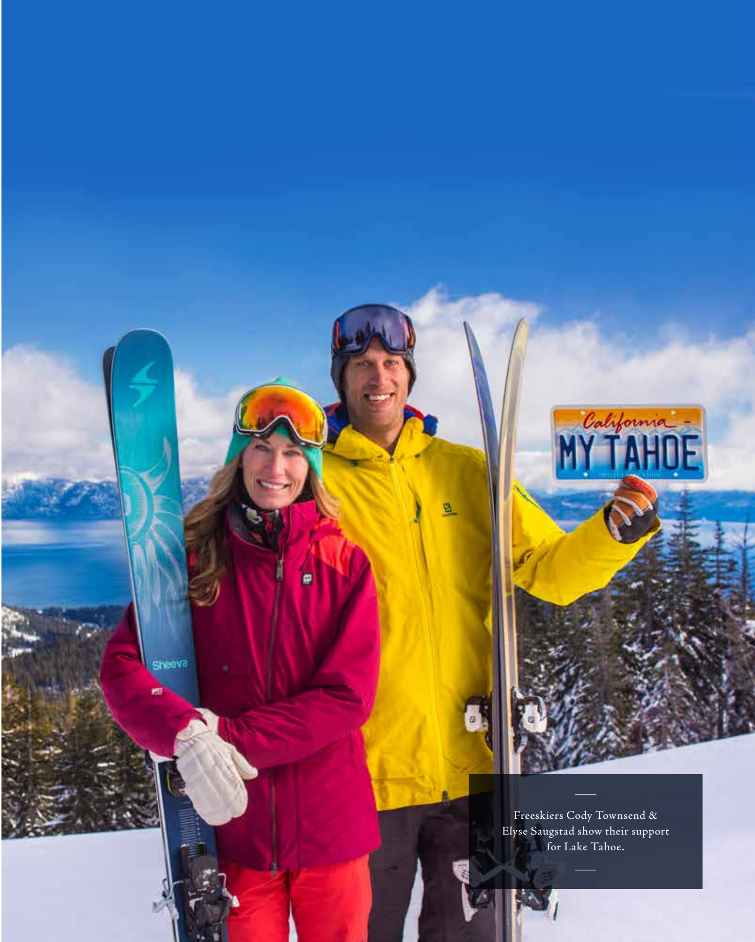
Freeskiers Cody Townsend & Elyse Saugstad show their support for Lake Tahoe.