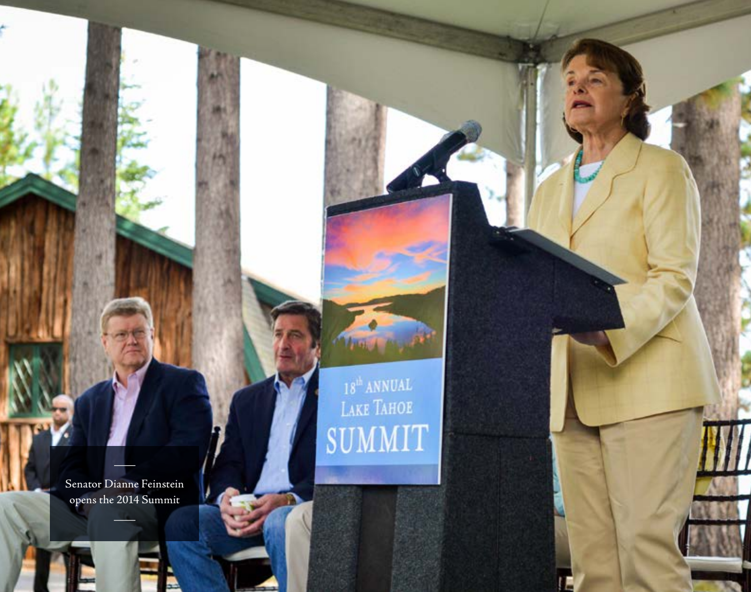
— Senator Dianne Feinstein opens the 2014 Summit —