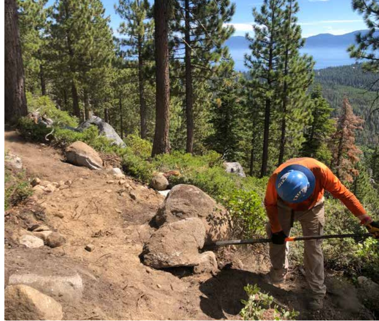
TAMBA Trail Crew

Relocating Tahoe XC's popular trailhead to provide easier access for outdoor adventures. The new trailhead will feature state-of-the-art facilities and EV chargers, and will help reduce overflow parking in nearby neighborhoods.