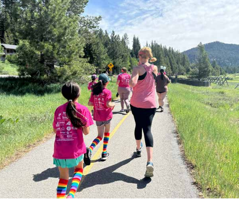
Girls on the Run Sierras