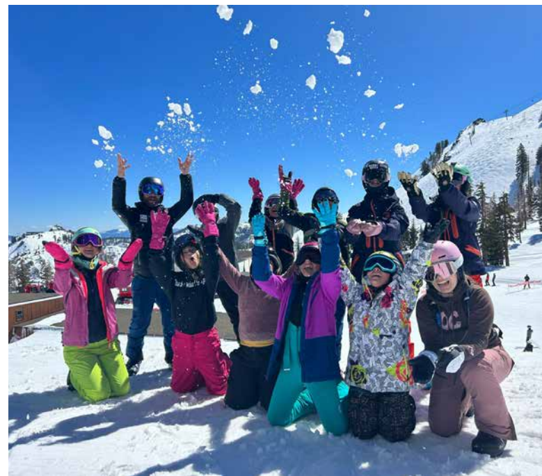
SOS Outreach Mentorship Program

An environmental newspaper published by the TRPA.