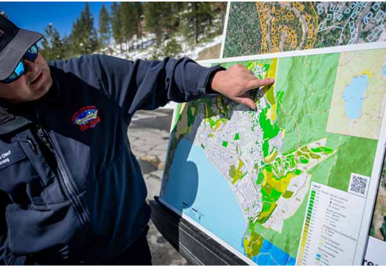
Fire Smart Community Pilots.

REDUCE THE RISK OF CATASTROPHIC WILDFIRE