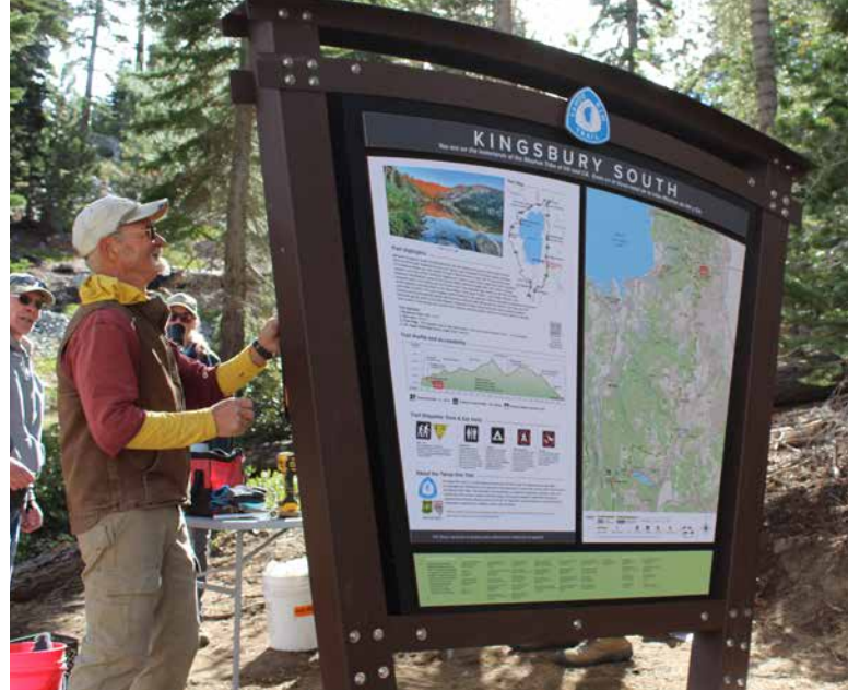
Tahoe Rim Trail Kiosks

16 new durable, bi-lingual trailhead kiosks will be installed by the Tahoe Rim Trail Association at Tahoe Rim Trail access points to improve safety, accessibility, and the overall visitor experience for an estimated 700,000 annual users.