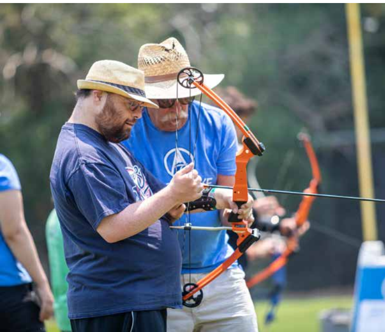
Achieve Tahoe Adaptive Summer Program