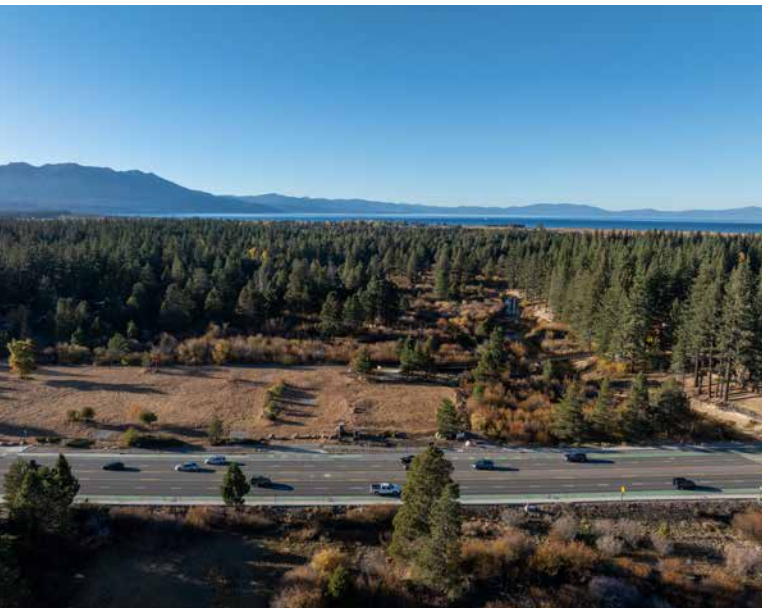
Upper Truckee River Restoration.