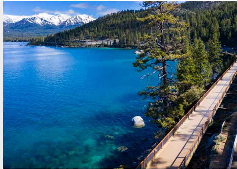
East Shore Trail Extension.

One of the most iconic trails in Tahoe is expanding. Plans are underway to extend the Tahoe East Shore Trail to Spooner Summit, starting with two miles of path from Sand Harbor to Secret Harbor. Funds raised from engraved trout plaques and names on the donor wall are already supporting this next phase. Scenic vista points will be available soon.