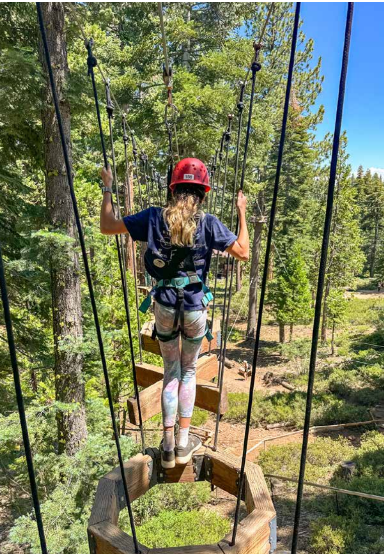
Left: Boys & Girls Club Summer Adventure Program

An eight-week work-study program with the U.S. Forest Service for local high school students that provides career experience while fostering a love of the outdoors.