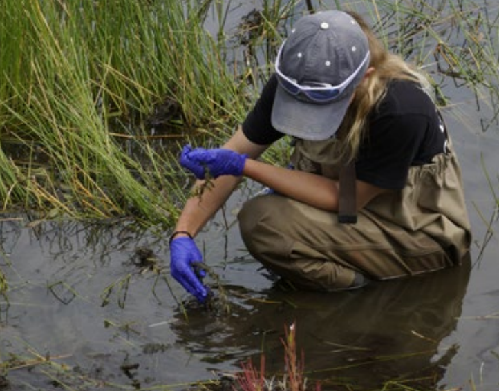
Pope Marsh Aquatic Invasive Species Removal

Scuba divers from Clean Up The Lake continued removing litter from high-volume hotspots on the North Shore during The 72-Mile Cleanup.