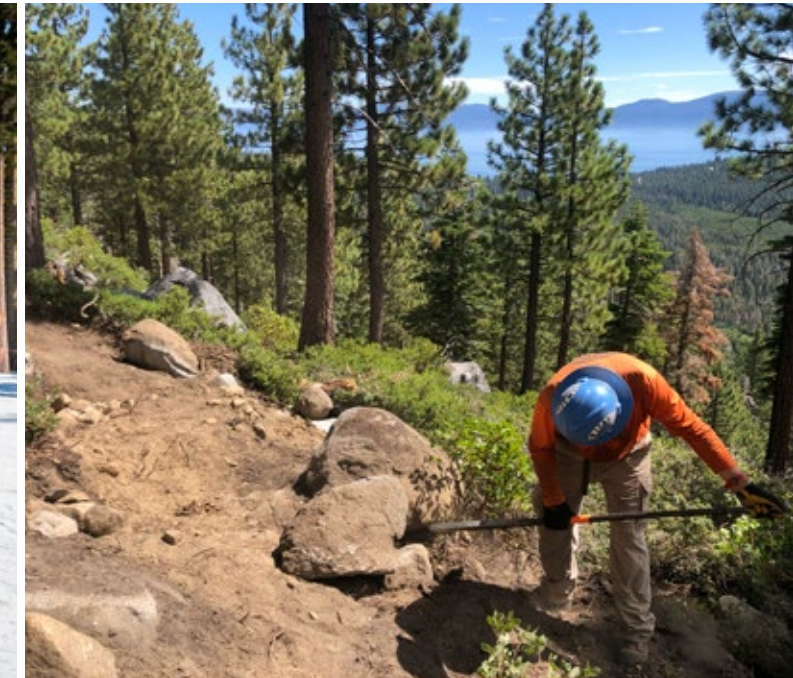
TAMBA Trail Crew