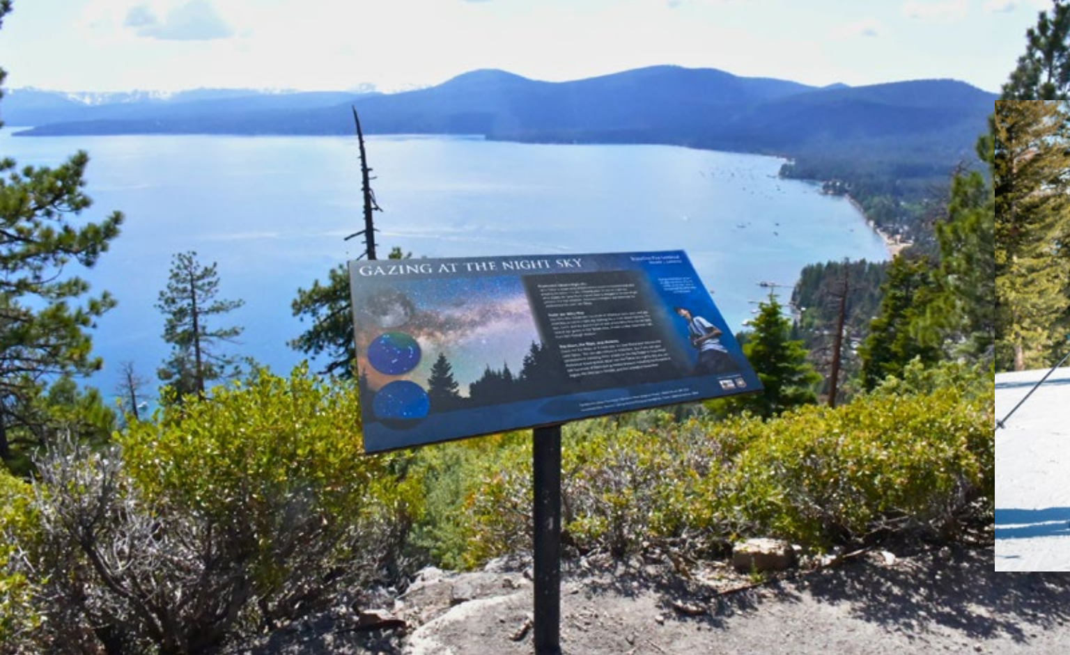
Stateline Fire Lookout Panels