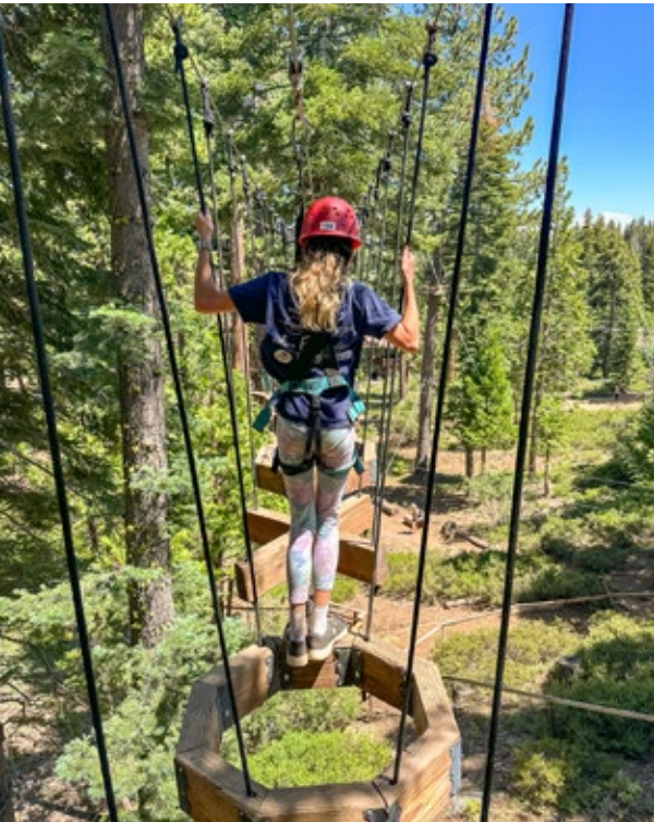
Boys & Girls Club Summer Adventure Program

Planning and construction of new parking lots and trail segments along SR 28 as the expansion to Spooner Summit continues.