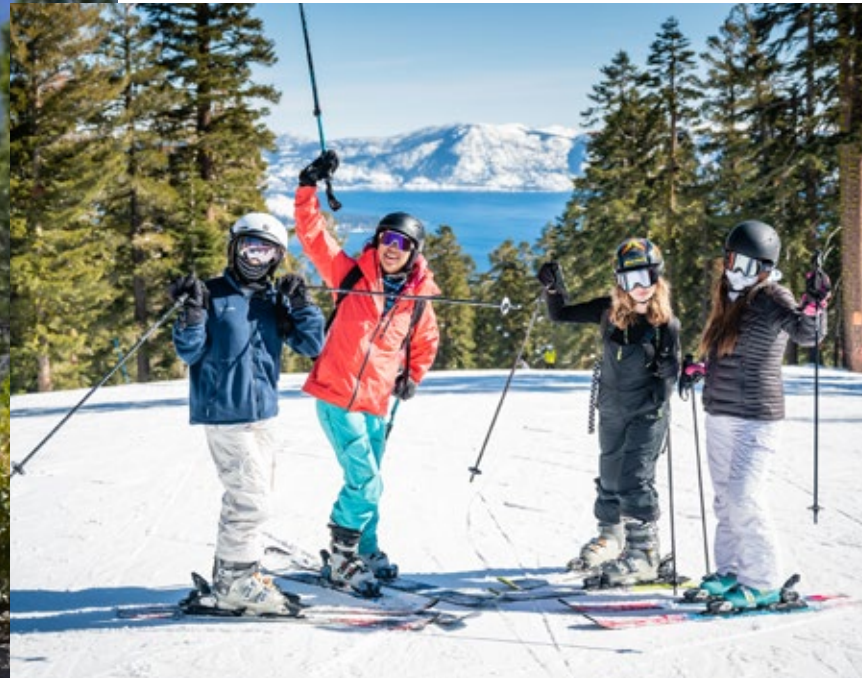
SOS Outreach Mentorship Program

A new 2.28-mile multi-use trail that will provide users with a safe alternative to descend from the Marlette Flume Trail, the Incline Flume Trail and the Tahoe Rim Trail.