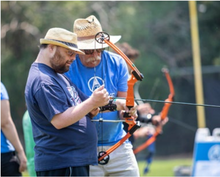
Achieve Tahoe Adaptive Summer Programs

A new edition of the Lake Tahoe Basin’s premier plant guide, featuring a comprehensive record of native plants, invasive species, and the ecological roles plants play in sustaining the health of Lake Tahoe’s environment.