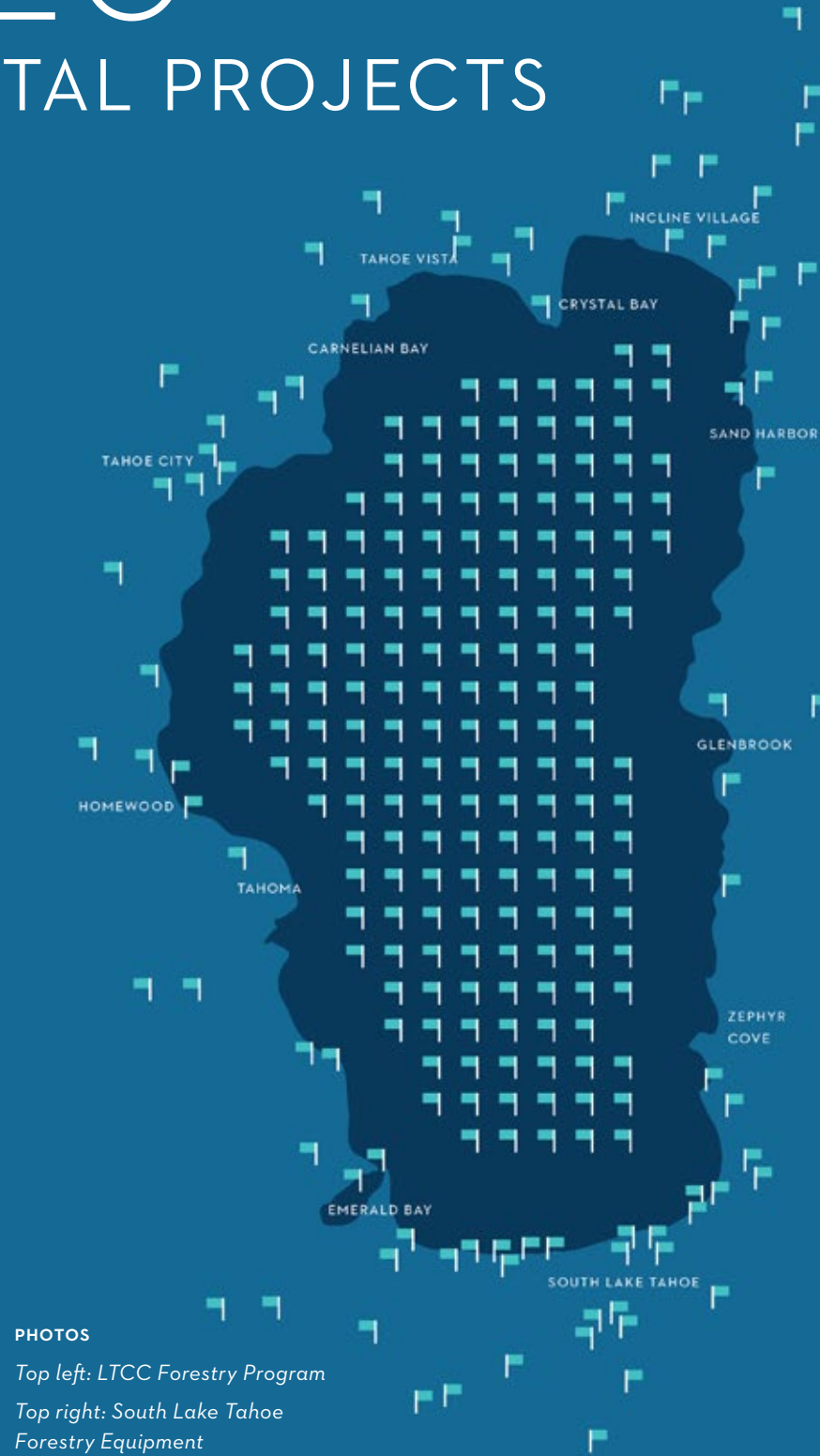
PHOTOS Top left: LTCC Forestry Program Top right: South Lake Tahoe Forestry Equipment Bottom: LTCC Forestry Program